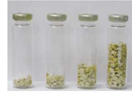
Figure 1: Comparison of 1g, 2g, 4g, and 8g of a HT Polymer Sample in 22mL High Temperature Headspace Vials.

A HT polymer was obtained as raw pellets. Four sample weights, 1g, 2g, 4g, and 8g, were weighed into 22mL headspace vials. These were capped and sealed with Teflon lined septa. The sample weight range will provide data to determine the linearity of the VOC and SVOC peaks observed in the sample. Figure 1 is a photo of the four sample size concentrations, indicating their volume in the 22mL headspace vial.