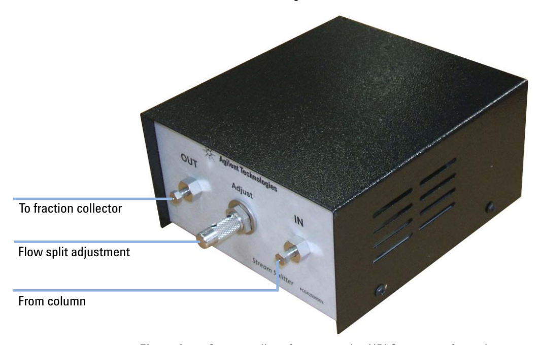
Figure 1 Stream splitter for preparative HPLC system – front view

The split ratio is determined by manually adjusting the needle valve, which is located in the center of the front panel.