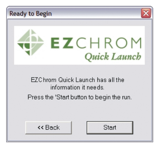
Figure 2. EZLChrom Quick Launch makes it simple and easy to perform routine data acquisition and processing. One click will start instrument control, setup the autosampler, perform the injection, collect and process the run, and generate the report.

EZChrom Quick Launch users log into a special display. Only the analyses and instruments assigned to that specific EZChrom Quick Launch user are displayed.