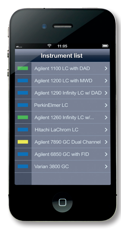
Figure 3. Untether from your lab by utilizing the OpenLAB CDS iControl Panel application to view your system status from anywhere — even from your smart phone.

To learn more about OpenLAB CDS, visit us at www.agilent.com/chem/openlab