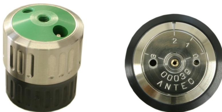
Fig 1. Left side : photo of assembled SenCell inlet block (green) with In-Situ Ag/AgCl (ISAAC) reference electrode (REF). Right side : bottom side of the SenCell with the Cell working volume adjustment system, Auxiliary(AUX) electrode contact (opening on left side next to inscription '3') and Working electrode (WE) contact (opening in the center).

The SenCell is delivered pre-assembled and ready for installation and use.