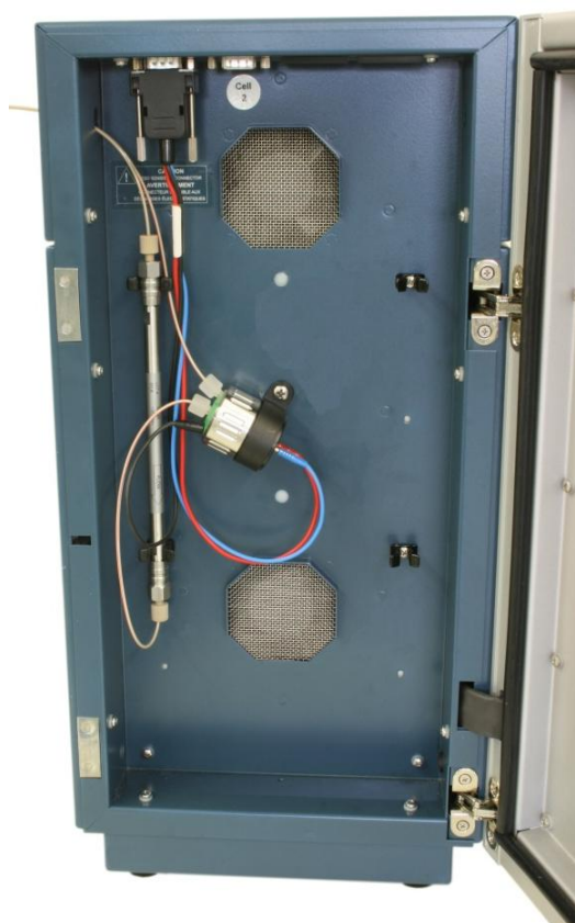
Fig 4. Installation of SenCell in DECADE II detector: photograph of DECADE II oven compartment with column and SenCell installed.

Copyright ©2012 Antec. All rights reserved. Contents of this publication may not be reproduced in any form or by any means (including electronic storage and retrieval or translation into a foreign language) without prior agreement and written consent from the copyright of the owner. The information contained in this document is subject to change without notice. The information provided herein is believed to be reliable. Antec shall not be liable for errors contained herein or for incidental or consequential damages in connection with the furnishing, performance, or use of this manual. All use of the hardware shall be entirely at the user's own risk.