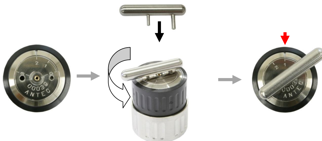
Fig 2. Adjustment of the working volume from position 2 (left side) to 1 (right side).

To adjust the working volume from position 2 to 1: